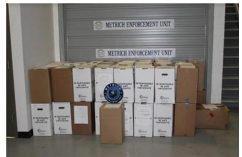
Originally published in the Richland Source on May 5, 2022.