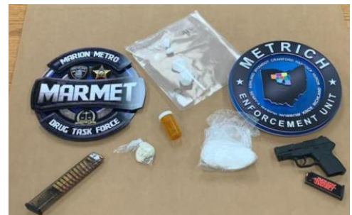
County Prosecutors Office.

The METRICH-MARMET Drug Task Force is made up of members of the Marion City Police Department, Marion County Sheriff's Office, and the Marion